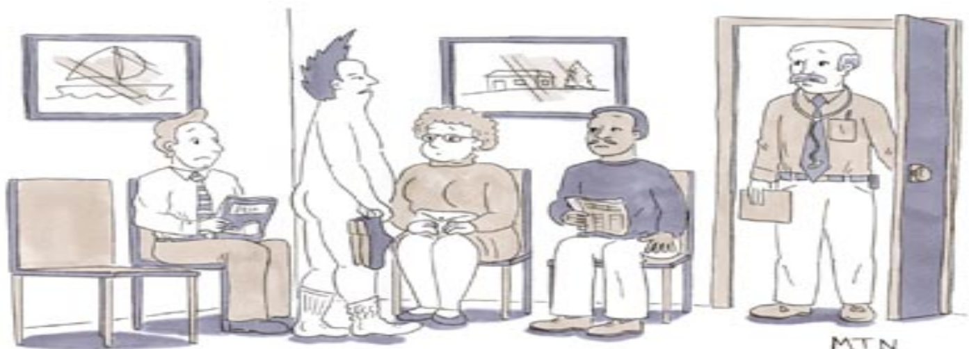
"I undress already to save us both some time."

Drexel University College of Medicine Bridging the Gaps Unitarian Universalist House Outreach Intern.