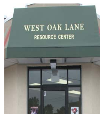
Let us help you get connected!

The Home Depot program, in particular, is a prime example of the NORC’s mission. “NORC” stands for “Naturally Occurring Retirement Community”—a community where people have lived much of their lives in the same home or neighborhood. When possible, the NORC aims to support older adults in their expressed desire to remain at home as they age by providing a spectrum of services.